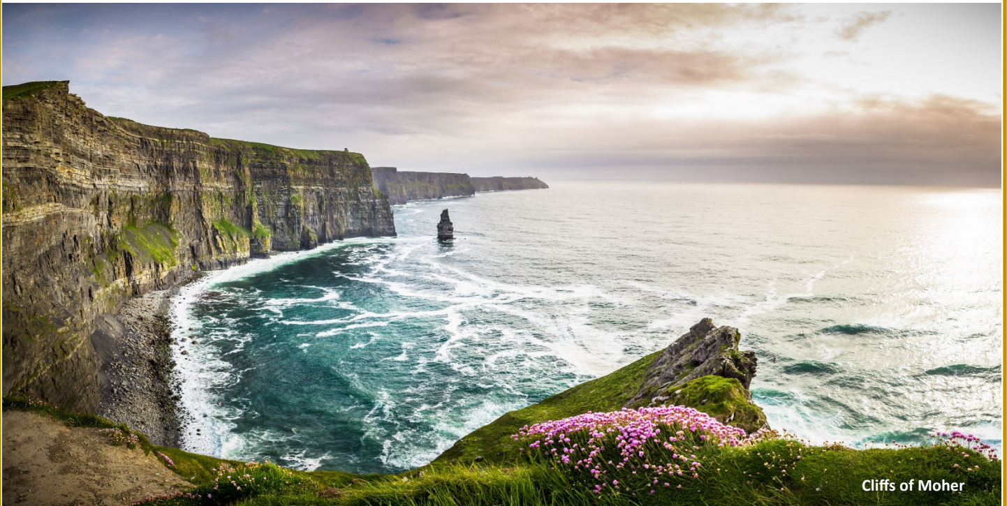
Cliffs of Moher

From $4,399 Air & Land 9 Days, 8 Nights Including Hotels, Meals, Day Trips, Bus to & Airfare From New York